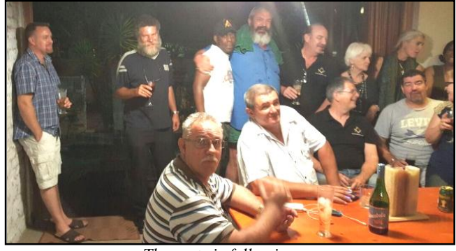
The party in full swing.

The trip had two objectives. Firstly, it was a focussed effort to assist a Lodge which is endeavouring to recruit new members. Secondly, it was an opportunity to cement the fraternal and social relationships between the Brethren of the Province. There is no doubt that a Province that "plays together, stays together". Freemasonry has to be "fun" and socialising in a relaxed environment certainly goes a long way to allowing the Brethren to get to know each other. Any team works together so much more effectively when they know each other's strengths and capabilities and there is no better way to establish this knowledge than "sharing time together in the pursuit of promoting the Order and enjoying harmless fun".