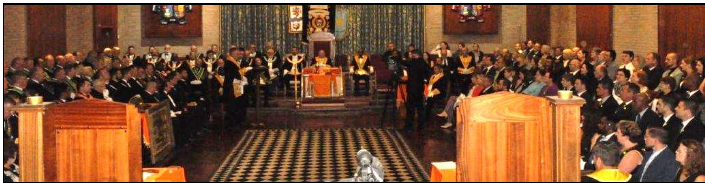
The Brethren and Guests assembled in the packed Temple.

Freemason's Hall in Park Lane Johannesburg was the venue for Northern Division's latest "What is Freemasonry?" presentation on Monday 13 th March - and what an evening it turned out to be!