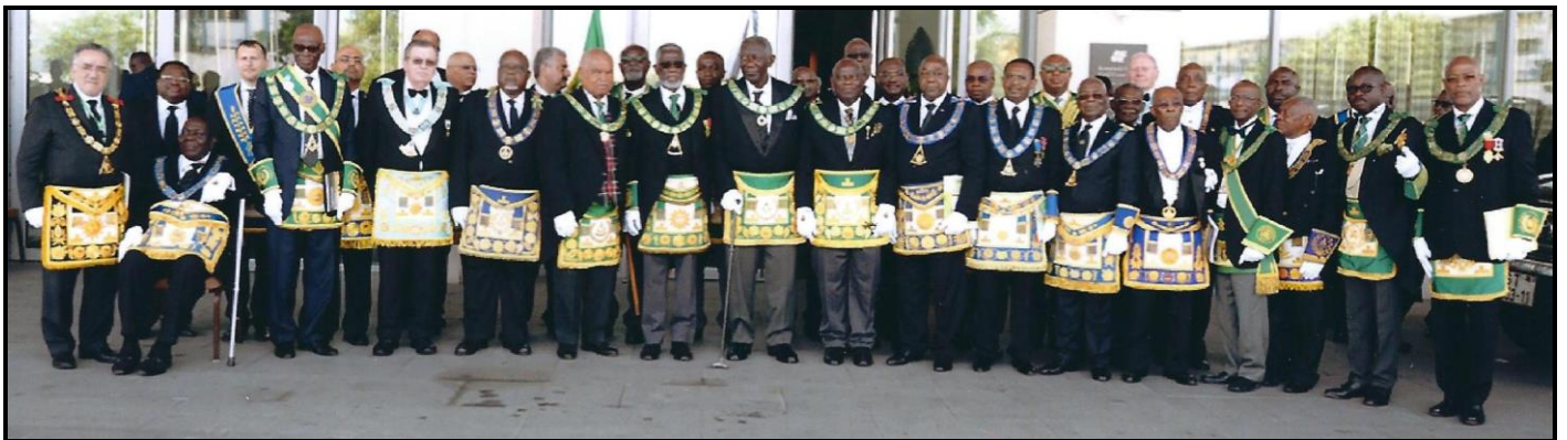
The Grand Lodge of Ghana Senior Officers with the visiting delegations. The tall Brother on the right of the new Grand Master is RW Bro John Kufour, a greatly respected Past President of Ghana and a newly appointed Senior Warden of the UGLE.