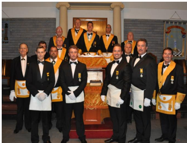
The BB of Lodge Libertas

Brethren, it is time for colds and flu and the strain expected this year could have serious complications if not tackled soonest. Take care and wrap up warmly.