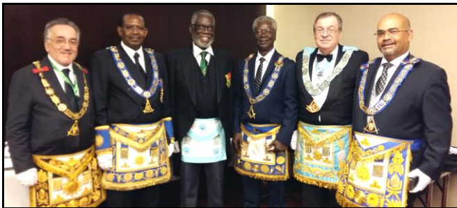
The Grand Masters of Morocco, Mali, Ghana, Ivory Coast, South Africa and Mauritius.

The Conference had 16 African Grand Lodges present, each with their own challenges to address. The various interactions were interesting, sometimes even fiery, but important issues were discussed.