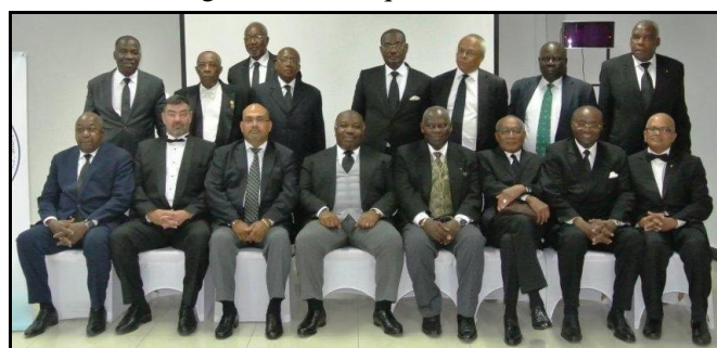
The delegates to the African Grand Lodge's meeting

treatment that our African Brethren have become so well known for. After much, often heated, debate the Agreement document was completed and signed and the focus moved on to the Annual Meeting and the Banquet.