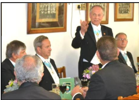
The Grand Master addresses the Brethren Lodge milestone

the company was excellent, the Brethren really enjoyed being together again and all present agreed that justice had been done to a very important