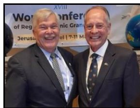
GL of New York