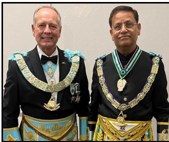
GL of India

Here are pictures of some of the Grand Masters which we were privileged to meet in Jerusalem.