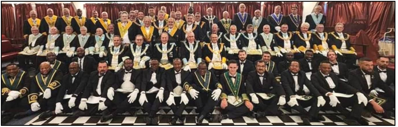
As you can see, the Eastern Division AGM weekend was extremely well attended!