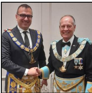
GL of Serbia