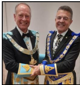
GL of Western Australia