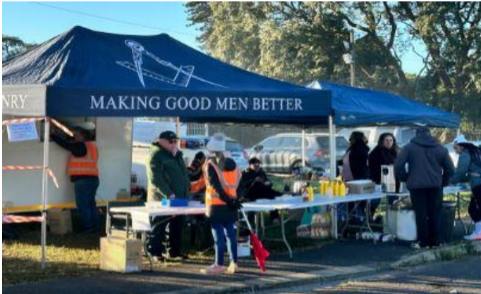
The Masonic marquee was a real attention grabber and did Freemasonry proud!

For a number of years now all Masonic Constitutions have gathered to provide assistance to the athletes running the Comrades. This year was no different as on Sunday, 9 th June 2024 Masons supported the marathon which this year commenced in Pietermaritzburg and ended in Durban.